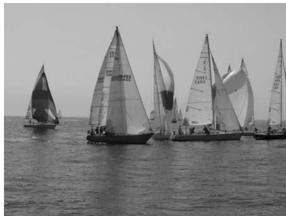
Mark rounding is always exciting

leeward turning mark was rather entertaining as boats from all classes converged together asserting their right-of-way.