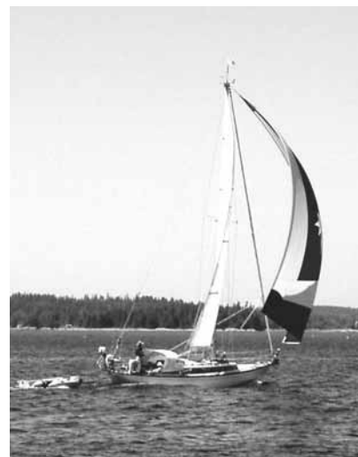
Narada enjoys some fine late summer sailing