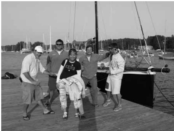
Competitors fresh from the race course